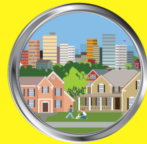
Curbside & Municipal Programs

E360S Battery Processing Division 1.888.937.3382 batteries@e360s.ca www.rawmaterials.com