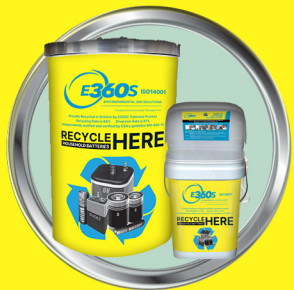
Retail and ICI Programs